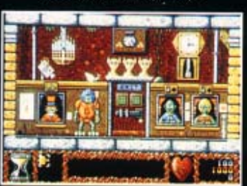
Screenshots may vary.

UNIT 1. HAMPTON ROAD INDUSTRIAL ESTATE, TETBURY GLOS