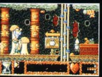
Screen shots taken from ATARI ST version.